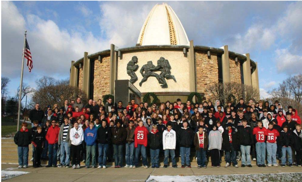
We are stronger together than we are apart.